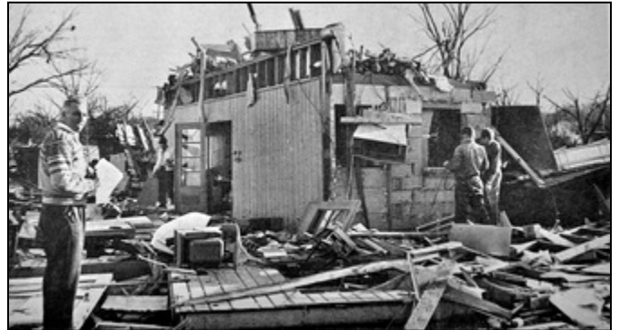
Les Case and the remains of Case Plumbing and Heating building