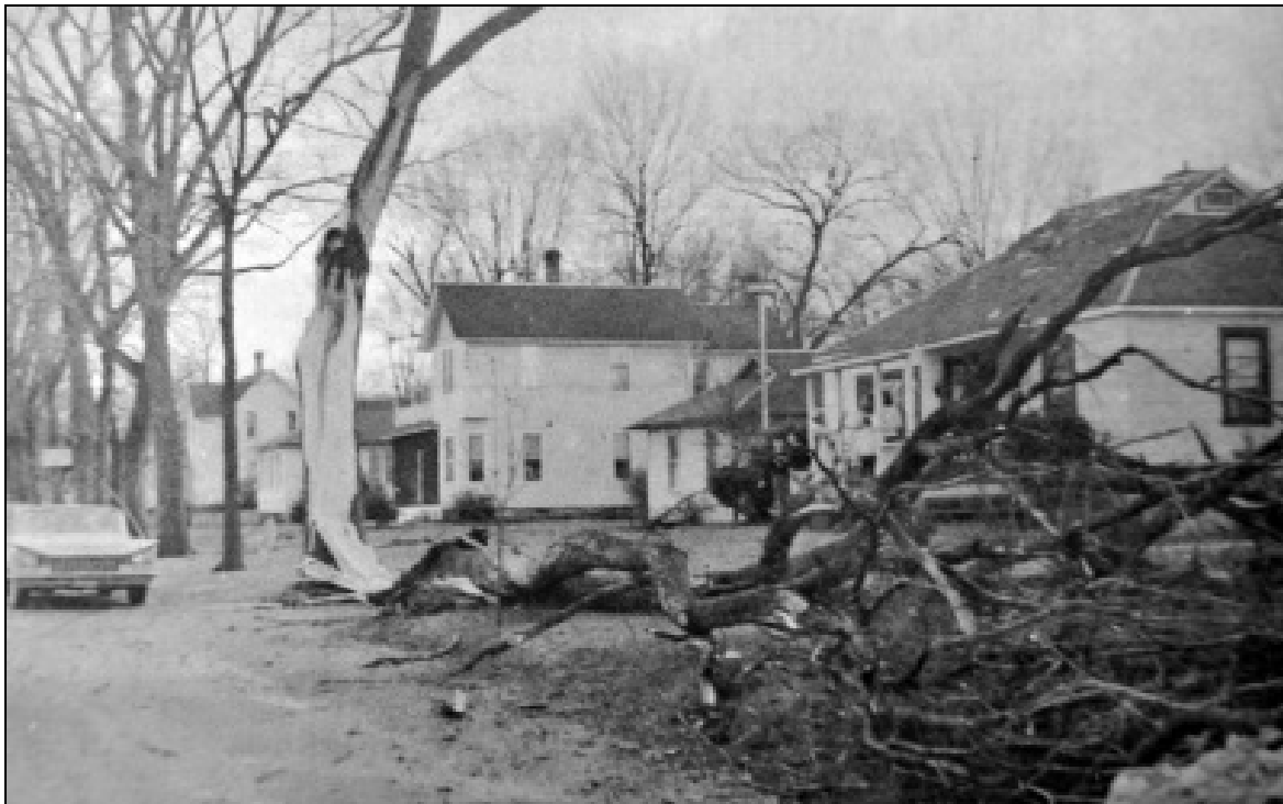
Looking south on Elmhurst Court