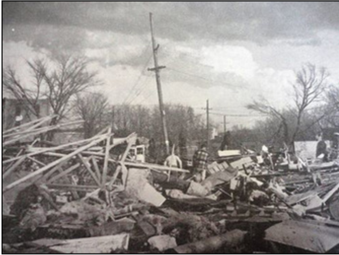
What was left of Peterson Cabinet Shop

The tornado continued through the village, destroying the buildings of Peterson Cabinet Shop and Case Plumbing and Heating. On the opposite side of Elkhorn Road, the horse owned by Joe Herman was in the field untouched by the storm.