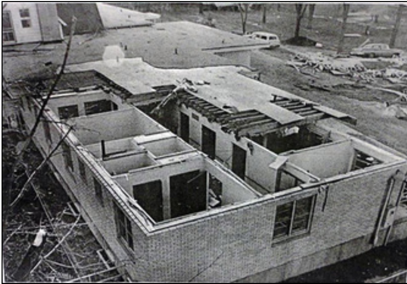
Sherwood Rest Home

Windows, structures and hundreds of trees in the tornado's path were damaged or destroyed. The roof on the new east wing of Sherwood Rest Home was ripped from the walls and disappeared with the twister. Amazingly no residents were injured.