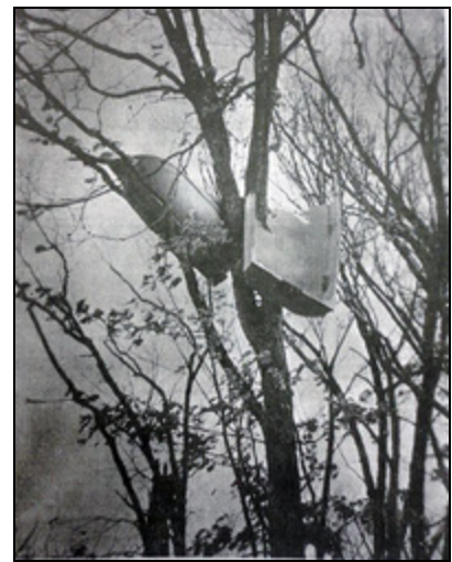
The twister left boats in the trees